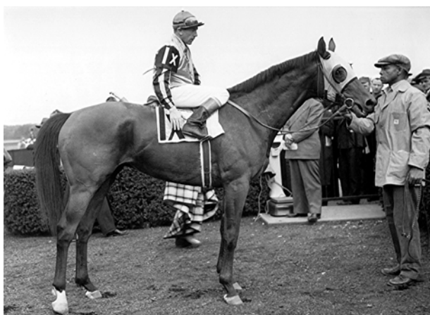
Devil Diver with George Woolf Up